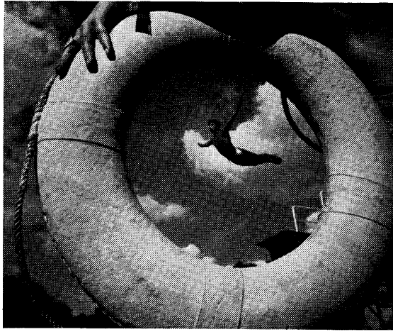
Formula for getting into Exhibitions "Frame your Picture". All illustrations by the Author